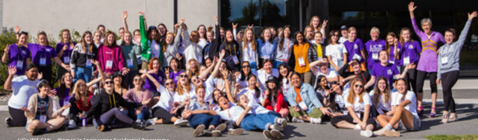
UC's WIE CAN — Women in Engineering Residential Programme