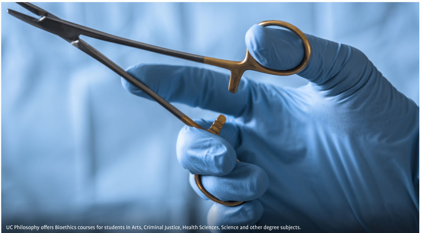
UC Philosophy offers Bioethics courses for students in Arts, Criminal Justice, Health Sciences, Science and other degree subjects.